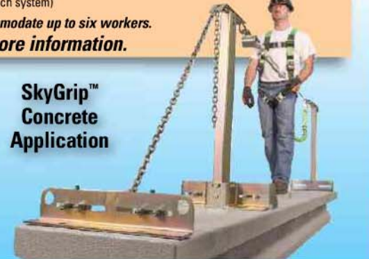
SkyGrip™ Concrete Application

Longer systems available that will accommodate up to six workers. Call your representative for more information.